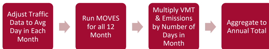
Figure A.2 Calculation of Annual Emissions

For the 2017 and 2030 technology scenario emissions inventories, the traffic data was based on roadway segment data obtained from the Maryland State Highway Administration (SHA). This data does not contain information on congested speeds and the hourly detail needed by MOVES. As a result, post-processing software (PPSUITE) was used to calculate hourly-congested speeds for each roadway link, apply vehicle